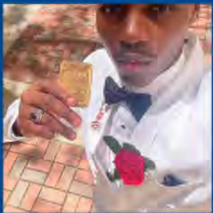
Outstanding Regis Man Award