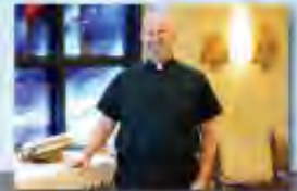
Embracing the Legacy of Service

The mission of St. Pius X Residence is to provide a nurturing environment that respects and cherishes the lifelong commitment of our beloved priests. The Residence strives to create a warm and supportive community where they can enjoy their retirement years with dignity, surrounded by like-minded individuals who share their dedication to faith.