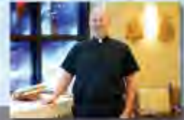
Abrazando el legado de servicio

La Residencia San Pío X tiene como misión ofrecer a nuestros queridos sacerdotes un ambiente edificante, en donde se respeta y aprecia su compromiso de vida. Esta Residencia se enfoca en crear un ambiente cálido y de hermandad donde puedan disfrutar su jubilación dignamente, rodeados de otras personas que comparten su misma dedicación a la fe.