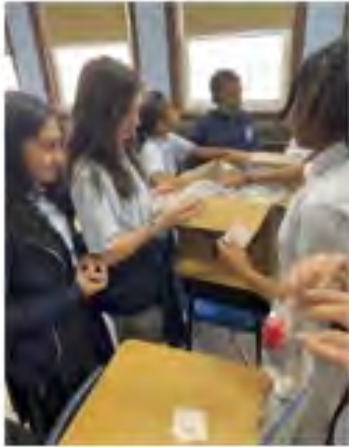
Sixth and seventh graders in the Aquinas Program made "goodie bags" of personal items for homeless men served at the Pax Christi Hospitality Center in Port Jefferson.

During Catholic Schools Week, all of our classes participated in a Day of Service :