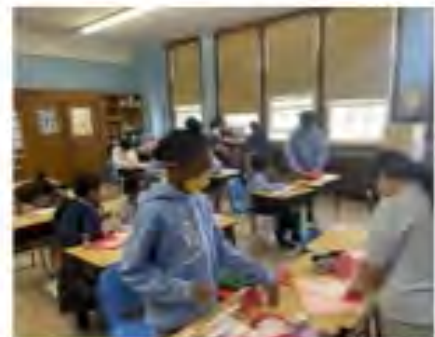
Students in grades 4 and 6 made Valentine's Day cards for patients at the Townhouse Center for Rehabilitation in Uniondale.