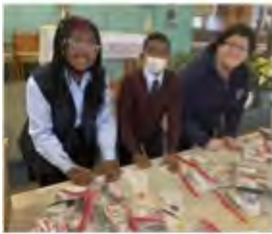
Children in grades 3 and 6 collected items to make birthday parties for Birthday Wishes, an organization that brings birthday parties to homeless children.