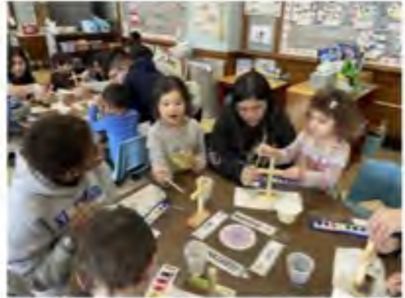
Children in Kindergarten and Pre-K and their 8th grade buddies painted crosses for residents in senior housing.