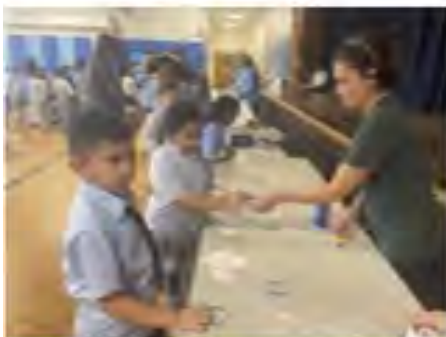
Many classes put together sets of cutlery wrapped in a napkin for The INN (Interfaith Nutrition Network) in Hempstead. They will be given to folks served in The INN's soup kitchen.