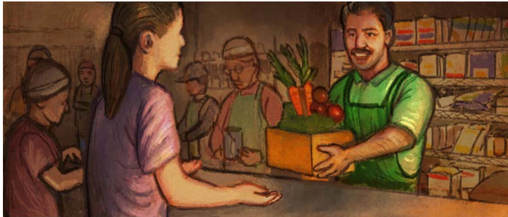
The first principle of Catholic social teaching is that each person possesses the dignity of a son or daughter of God.